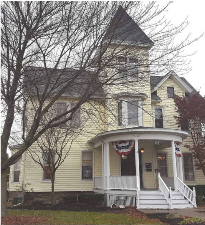
137 North Main Street, Fairport

The Perinton Historical Society is fortunate to have many supporters of its annual fundraiser, Yuletide Traditions . Many donors of the silent auction items have been on board since the inception of this holiday experience four years ago, working with others to create very special items. This month we are highlighting two such groups.