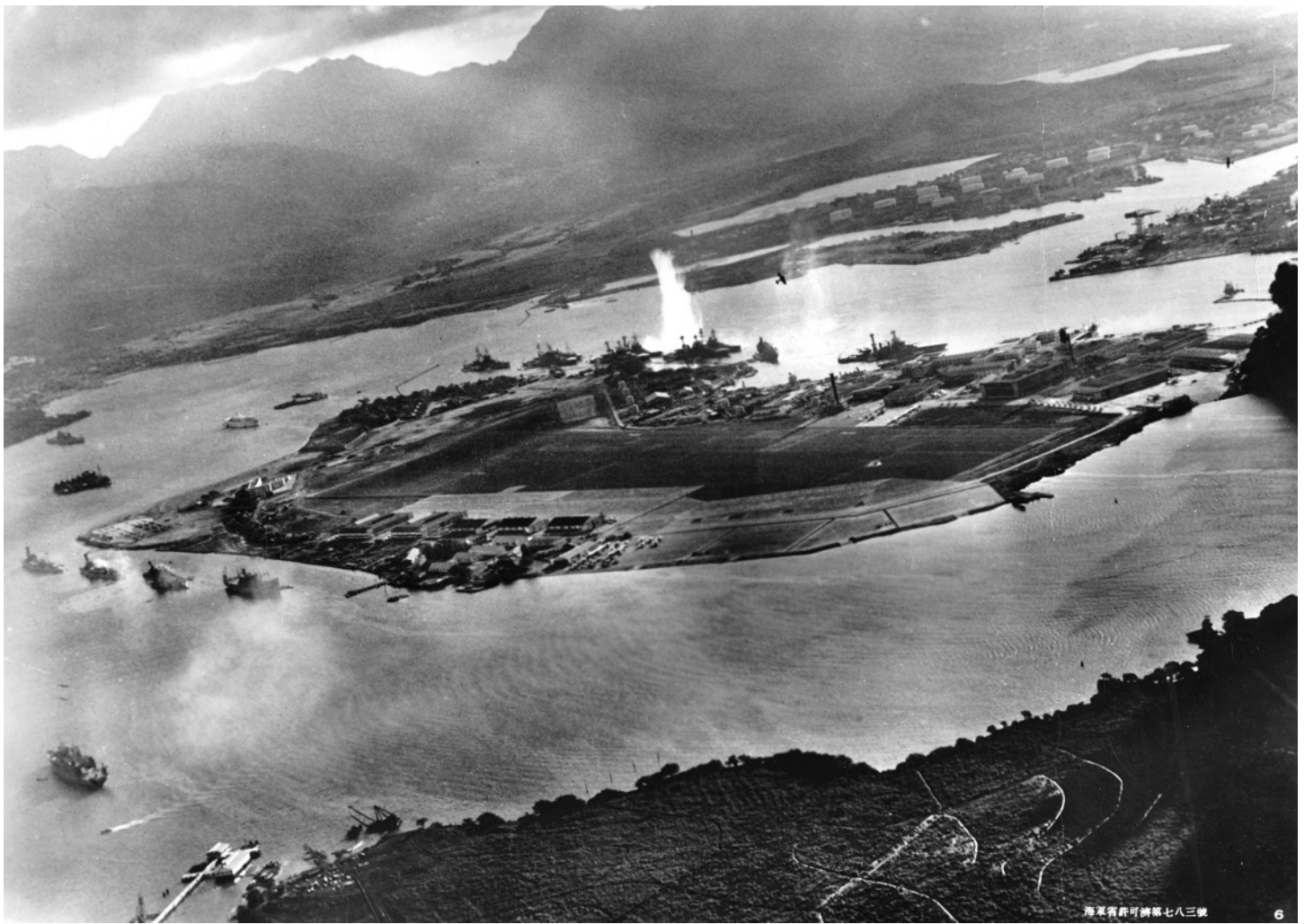
This graphic photo, taken from a Japanese plane, was shot shortly after the attack on Pearl Harbor began.