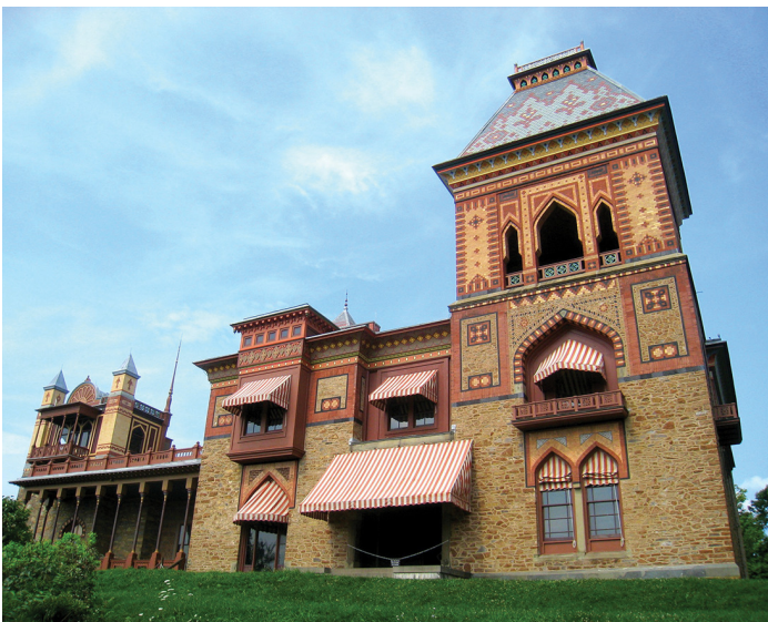
Olana, the country home of American landscape painter Frederic Edwin Church