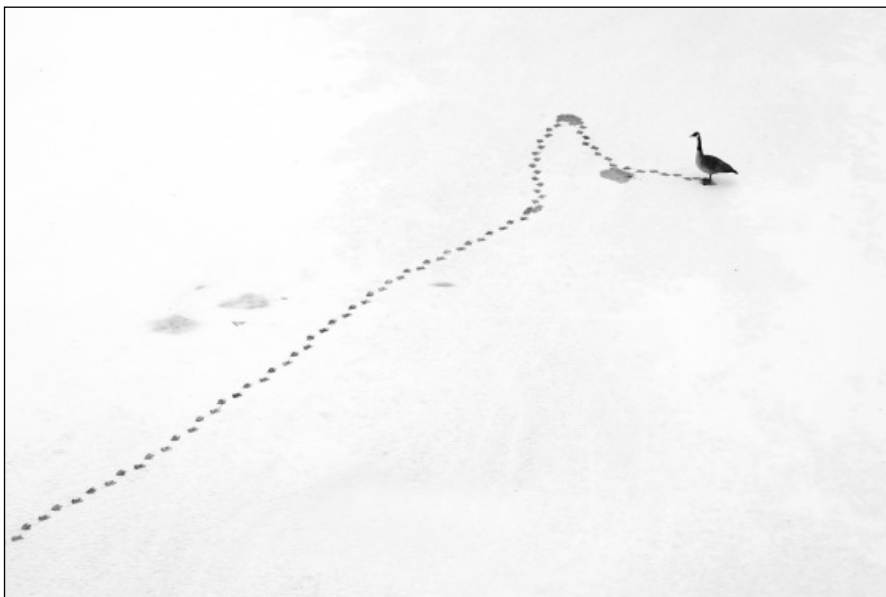
Confused Canada Goose On the Frozen Erie Canal

taken from Perinton's Turk Hill Road Bridge