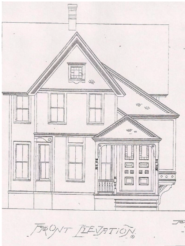
Front elevation drawing of the house at 8 Woodlawn Avenue.

the back. Across from the dining room is the master bedroom. Because the new owners, Francis and Elizabeth were elderly, it can be assumed that the bedroom was located downstairs so they could avoid climbing the stairs. The stairs in the front hall lead to the second floor called the "chamber floor". There is a 13' by 13' chamber room at the top of the stairs which overlooks the street. Two bedrooms are also on the second floor presumably for guests or grandchildren. There is no plumbing, bath or toilet in the house, so it is likely the owners took their baths in a portable tub in their bedroom and had an outhouse in the back yard.