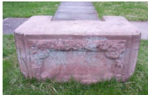
Stone mount found on Roselawn Avenue

If you would like to see these entries in the newspapers you can go to the Fairport Public Library and request the microfilm or you can go to fultonhistory.com and enter the subject heading.