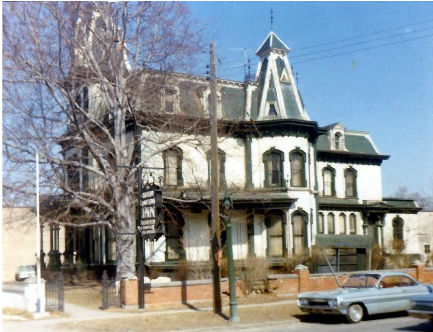
The Green Lantern Inn, as seen in this 1960s photograph