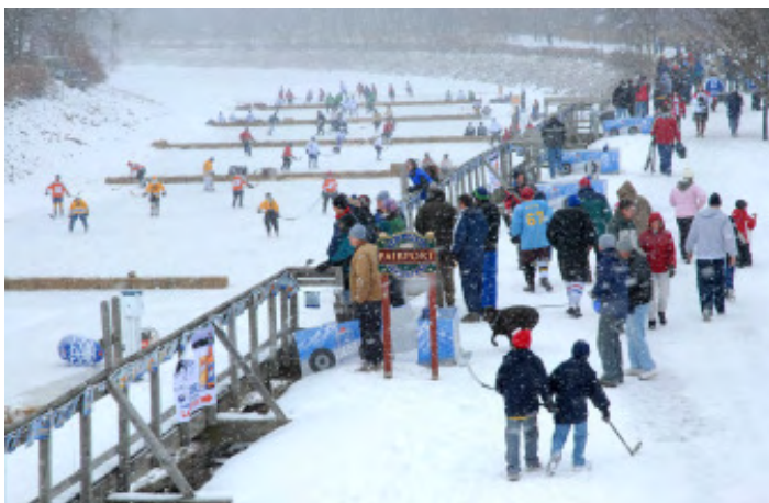
Pond hockey tournament on the canal in Fairport.