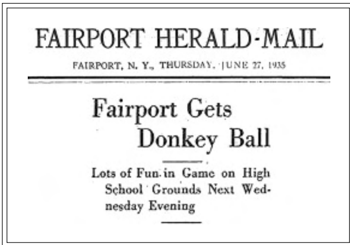
Fairport newspaper story from another donkey ball game, this one in 1935