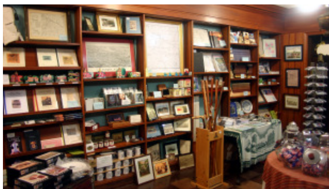
Gift Shop, Fairport Historical Museum