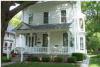
25 Woodlawn Avenue

Italianate features of the house are large paired decorative brackets, wide overhanging eaves, deep trim band, round eave windows, a two story bay window and tall windows with decorative Greek revival "ears". The barn has round-headed windows, and cupola with gable peaks.