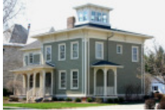
70 South Main Street