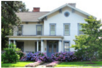
185 North Main Street